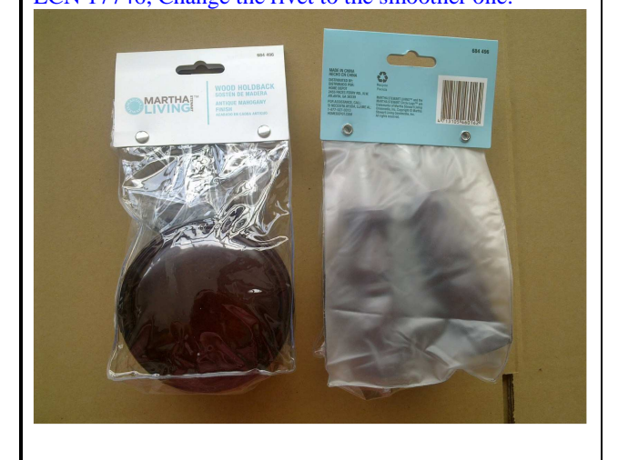
ECN 17751, Change the rivet to the smoother one. ECN 17746, Change the rivet to the smoother one.