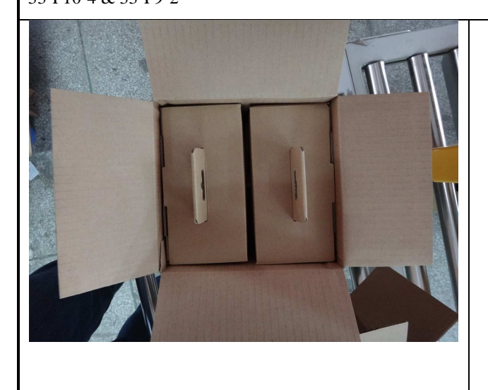
33-F10-4 & 33-F9-2