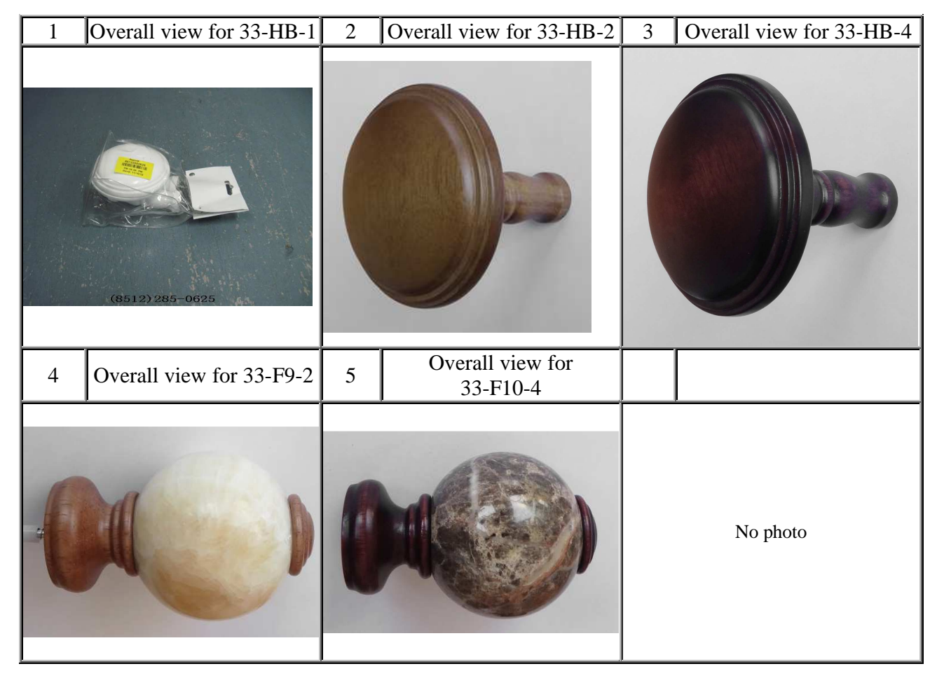
IMPORTANT: The product photos are not intended as the color reference