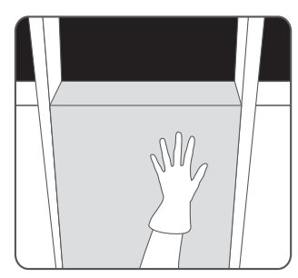
3. Release & expand

UltraBatt<sup>™</sup> insulation is flexible and pliable; simply squeeze the sides to compress the insulation and insert into the desired wall.