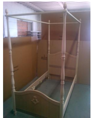
Img . Q