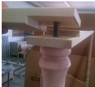
Img . O