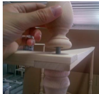
Img . P