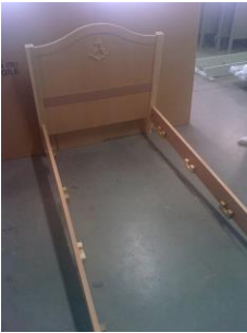
Img . H