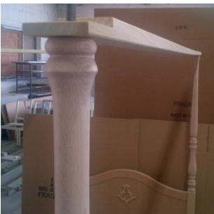
Img . N