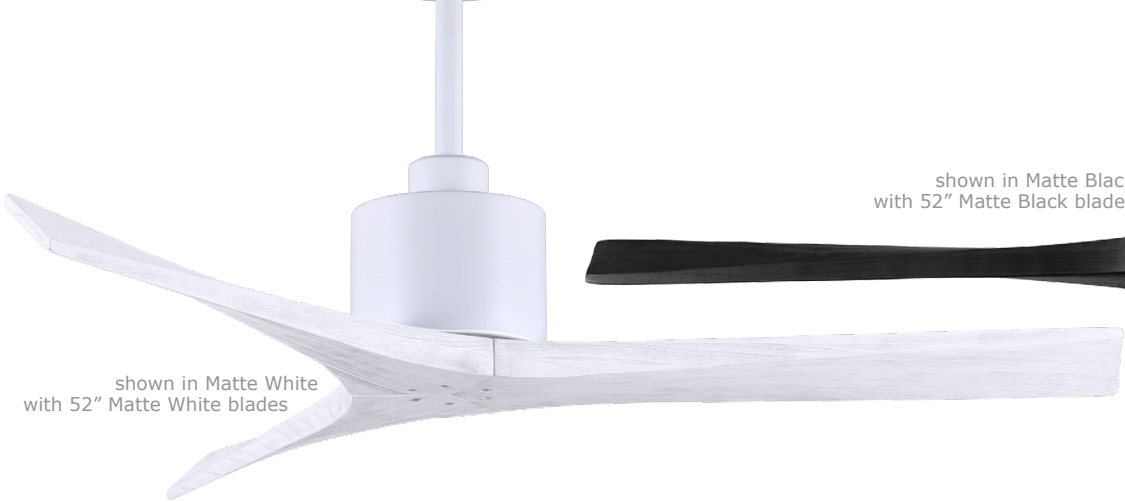
shown in Matte White with 52" Matte White blades