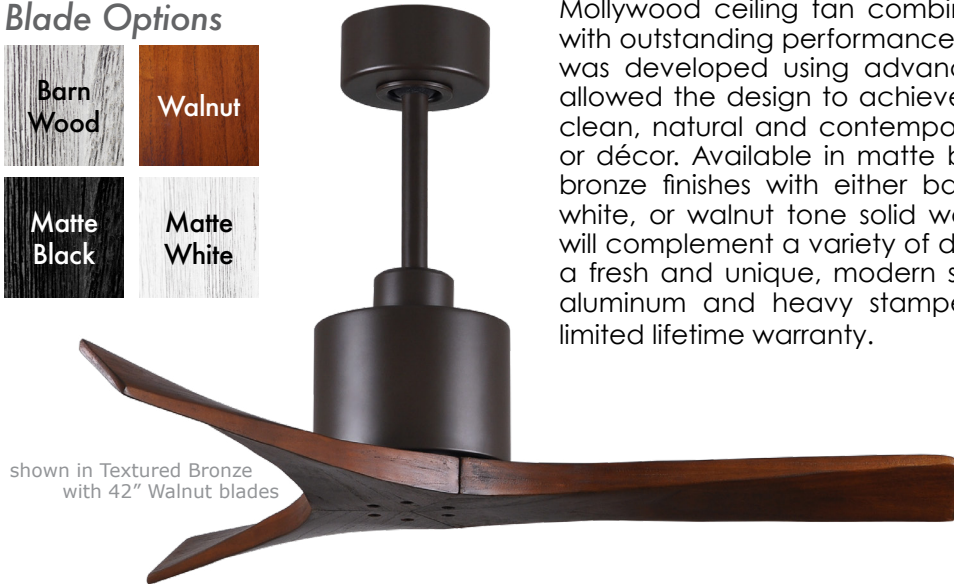
shown in Textured Bronze with 42" Walnut blades

Designed by Chicago architect Stephen Katz in 2018, the Mollywood ceiling fan combines modern organic geometry with outstanding performance and function. The blade shape was developed using advanced computer software which allowed the design to achieve complex forms. The result is a clean, natural and contemporary look perfect for any room or décor. Available in matte black, matte white, or textured bronze finishes with either barn wood, matte black, matte white, or walnut tone solid wood blade options. Mollywood will complement a variety of design styles while also providing a fresh and unique, modern statement. Constructed of cast aluminum and heavy stamped steel, Mollywood carries a limited lifetime warranty.