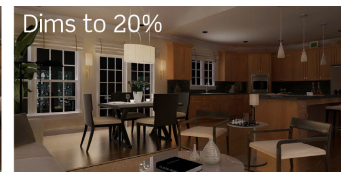
Dims to 20%

Can dim down to 30% or lower. Some minor performance issues may be present. Can use bulb selector switch to trim out flicker*.