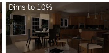
Dims to 10%

No flicker or performance issues dimming down to 20% or lower. Minimal adjustment may be required*.