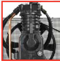
Cast Iron, Two Stage Pump