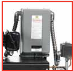
Mounted and wired motor starter