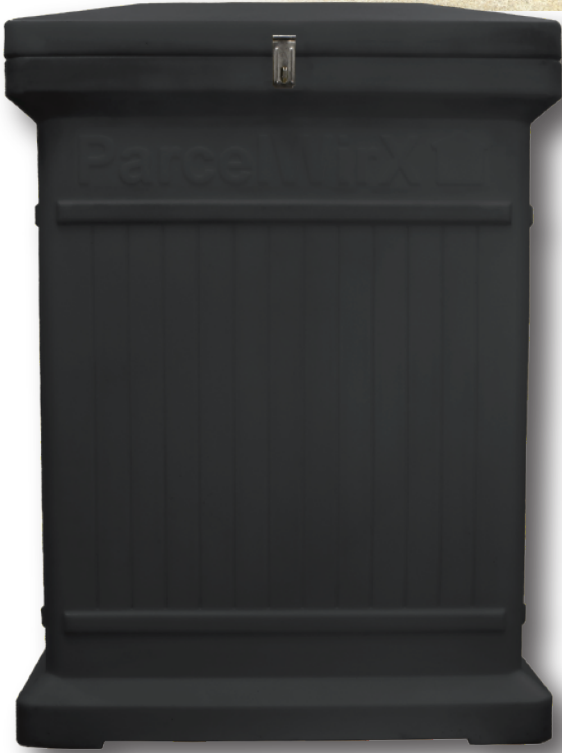
* premium shown above