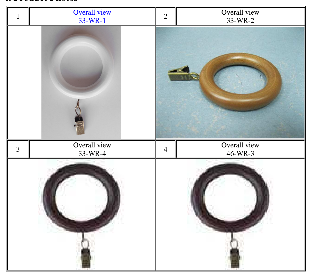
IMPORTANT: The product photos are not intended as the color reference