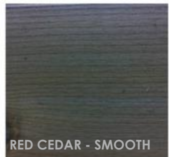
RED CEDAR - SMOOTH