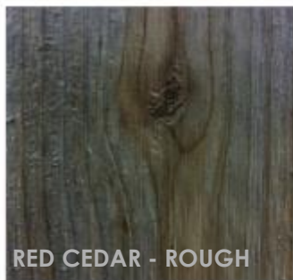
RED CEDAR - ROUGH