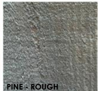
PINE - ROUGH