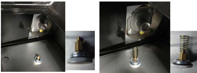
Position for NG