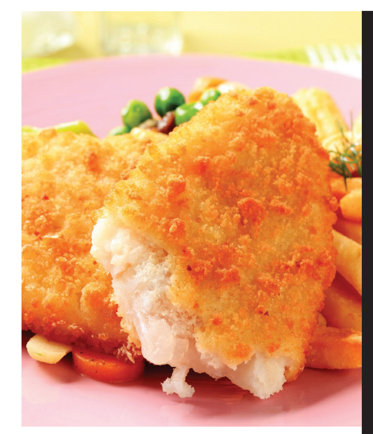
Oil-Less Frying Fish & Seafood