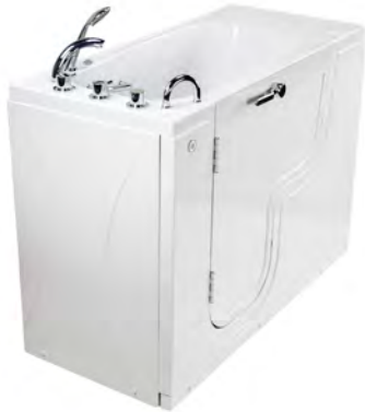
OLA&*52M-L Left Drain