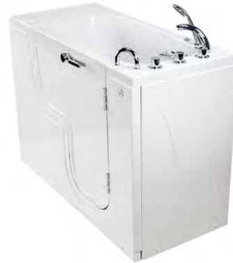
OLA&*52M-R Right Drain

Actual Size: 52" W x 52" L x 42" H Shipping Size: 54" W x 54" L x 50" H Shipping Weight: 300lbs. Net Weight: 220lbs. Water Capacity: 90 gal. US (unoccupied) 55-75 gal. US (occupied) Approx. Drain Time: +/- 2 minutes (unoccupied bathtub) at ideal home plumbing conditions Approx. Fill Time: 14 gallons per minute based on in-house water pressure (Disclaimer: Drainage time depends on house drain conditions.)