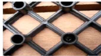
Stainless steel screws secure the tile to the base