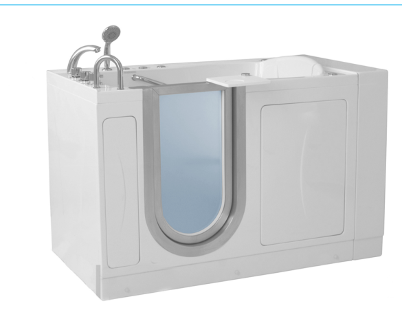
H3117 Left Hand Door