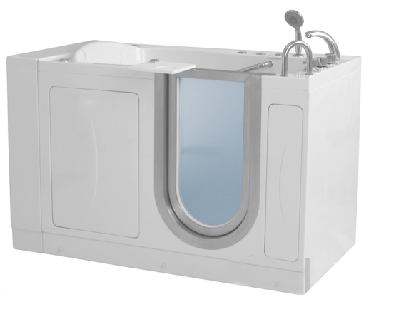
H3118 Right Hand Door