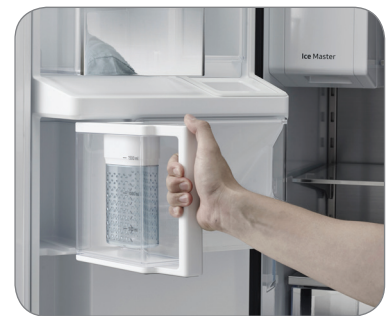
Auto Fill Water Pitcher