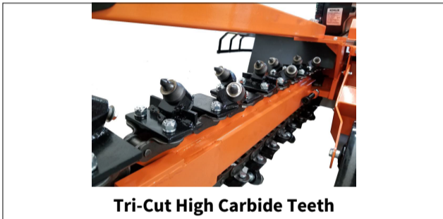
Tri-Cut High Carbide Teeth

Direct Chain Drive Trencher. High pressure sintered carbide teeth. 5 depth positions, dual locking wheels for digging in reverse. 3/8 plow plates with quick change teeth. Adjustable handle, Keyed safety lock out, 6 inch direct drive auger. Heavy gauge steel construction. 4000 RPM direct drive, 400 RPM tri-cut teeth chain drive. 200FT per hour dig rate.