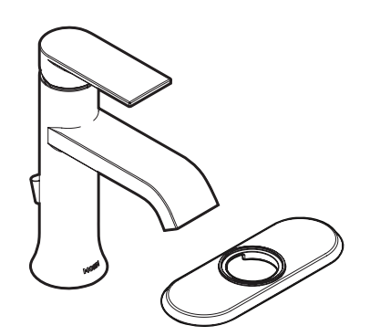
GENTA™ One-Handle Lavatory Faucet

Model: WS84760 series (includes deck plate)