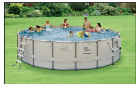
3. FILL WITH WATER