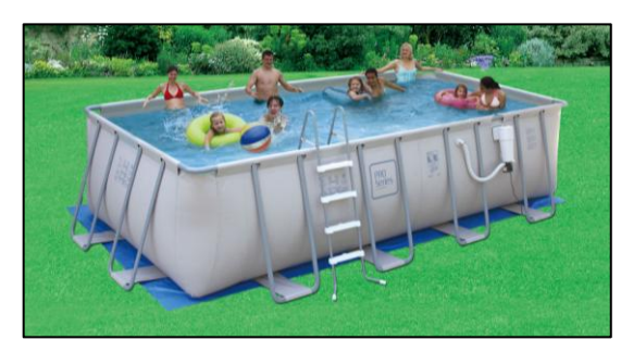
3. FILL WITH WATER