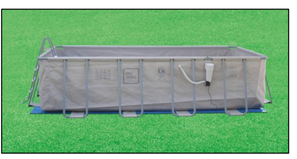
2. ASSEMBLE HORIZONTAL & VERTICAL BEAMS