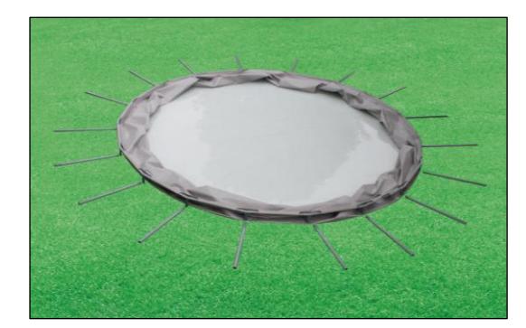
1. SELECT LEVEL LOCATION