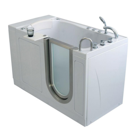
H3168 Right Hand Door