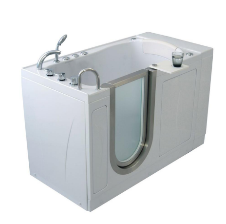
H3167 Left Hand Door