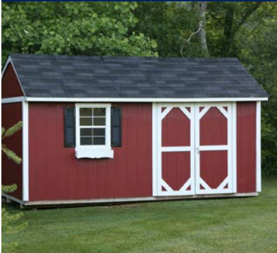
Undercoat Before Paint