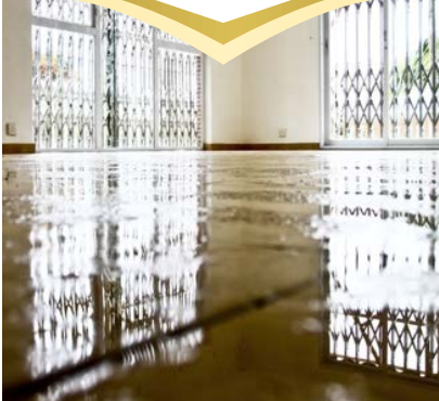
Flood Protection for Floors and Walls