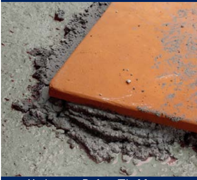
Undercoat Before Tile Mortar