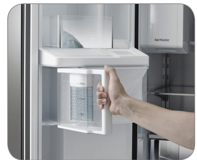
Auto Water Fill