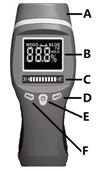
Fig. 1. The controls, indicators and physical features of the MM7

Fig. 1 shows all of the controls, indicators and physical features of the MM7. Fig. 2 shows all possible display indications. Familiarize yourself with the position and function of all components before moving on to the Setup Instructions and Operating Instructions.