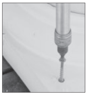
8. Apply construction adhesive* to bottom of base and nail or screw to floor.