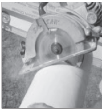
2. Use an abrasive saw (masonry or carbide tip blade). Fine trim top and bottom with rasp to assure flat surface contact.