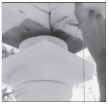
3. Slip base over top of column shaft and allow to slide to base of shaft. Slip cap over shaft and allow to rest on neck mold. Some sanding may be required.