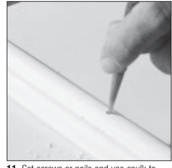
Set screws or nails and use caulk to cover holes.

*Use a non-acetone based exterior grade construction adhesive. PermaLite neck mold is one piece and slips over column.