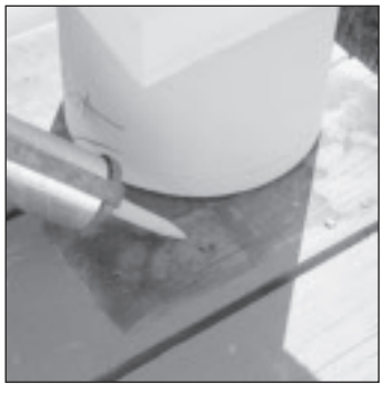
4. Apply construction adhesive* to top and bottom surfaces of column.