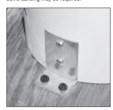
6. Mark and drill holes in floor and column shaft for corner/ angle brackets (not included). (HB&G column installation kit available #17040)