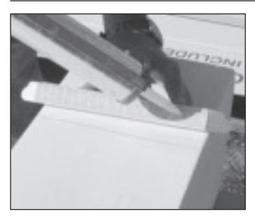
9. Mark location for supplied neck molding. Measure and cut neck molding to a 45° angle. Apply construction adhesive* and put neck mold in place.