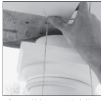
5. Put assembly in place and plumb. Make sure load is centered over column shaft and evenly distributed around the bearing surface.