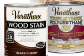
As shown Varathane 3X Wood Stain in Black Cherry, and Varathane Triple Thick Satin Polyurethane