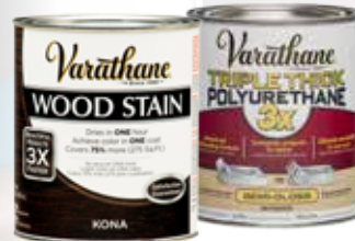
As shown Varathane 3X Wood Stain in Kona, and Varathane Triple Thick Semi-Gloss Polyurethane