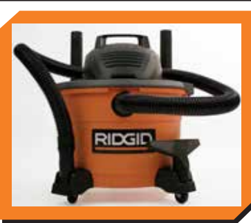
Hose and Accessory Storage