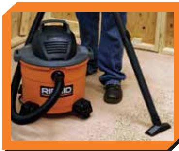
Dry Pick-up - Workshop, Garage etc.