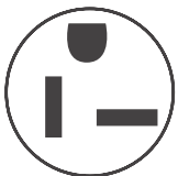
Plug Type (NEMA) 6-20P

1 Warranty 5 year sealed system/1 year full parts and labor.