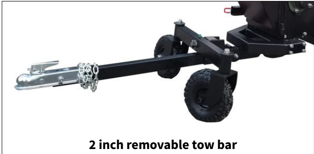
2 inch removable tow bar