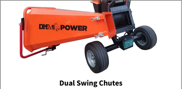
Dual Swing Chutes