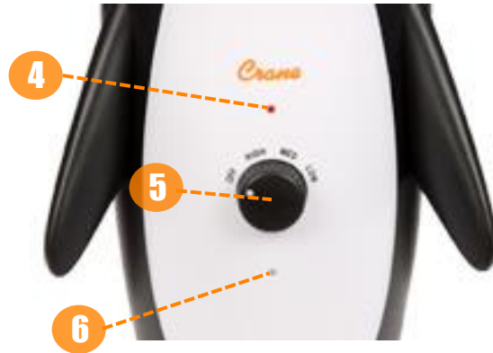
Fig. 3 (Bottom)