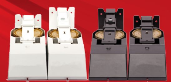
STFS Microhood in action

StoveTop FireStop Microhood utilizes four canisters and an integrated, self-deploying ramp to put out cooking fires and keep you safe...with no human intervention.