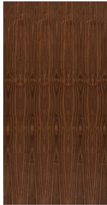
Walnut Plain Sliced B