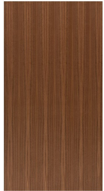
Walnut Quarter Sawn A