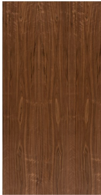
Walnut Plain Sliced A

Price: $$-$$$ depending on specifications