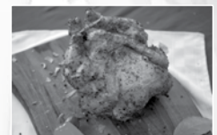
Chicken, page 15