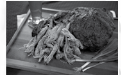
Pork Butts, page 11

Here's just a sample of what you can master with your A-MAZE-N SMOKER!