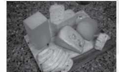
Smoked Cheese, page 14