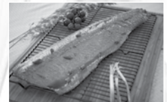
Salmon, page 12