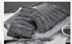
A-MAZE-N-BBQ Rub, page 16