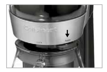
NOTE: Removing the carafe before the release cycle is completed will cause the coffee to flow out onto the counter.

Slide lever back to the Lock position and enjoy your Cuisinart<sup>®</sup> Cold Brew Coffee!