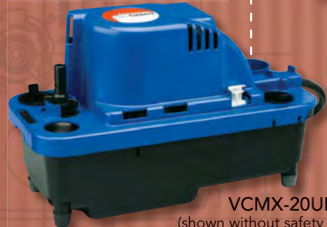
VCMX-20UL (shown without safety switch)