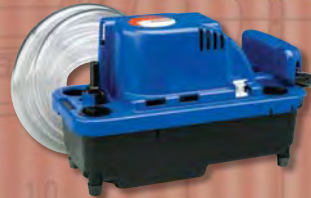
NXTGen with Tubing VCMX-20ULST