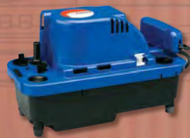
NXTGen VCMX-20ULS (shown with safety switch)