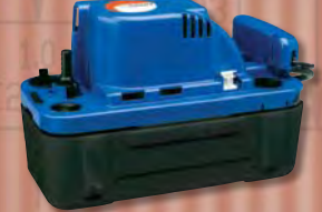
NXTGen with Anti-Sweat Sleeve VCMX-20ULS-C