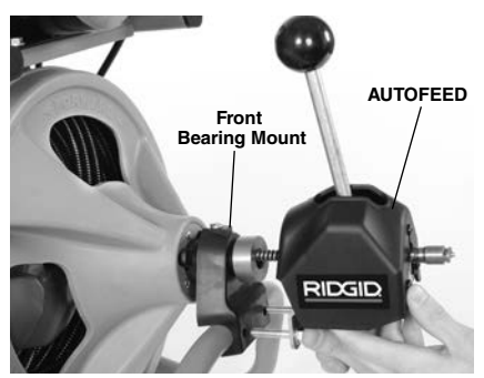
Figure 5 – Mounting AUTOFEED onto the Frame

Use the supplied fasteners to secure the AUTOFEED to the machine.