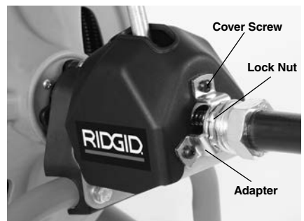
Figure 6 - Mounting Guide Hose To AUTOFEED