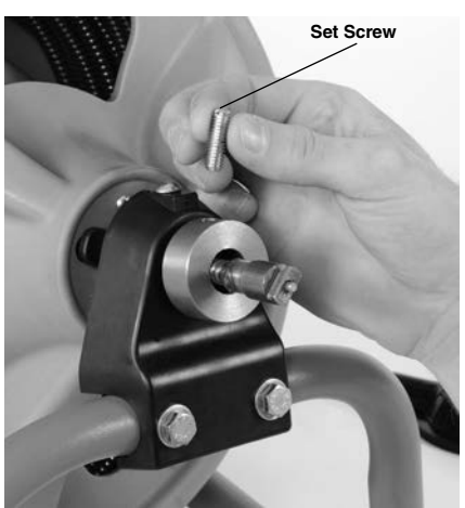
Figure 3 – Remove and discard the Cable Lock Set Screw

Remove and discard the 5/1/10" x 1" cable lock set screw from the Set Collar Assembly. The cable lock set screw is provided during packaging to keep the cable from coming out of the drum during transport ( Figure 3 ).