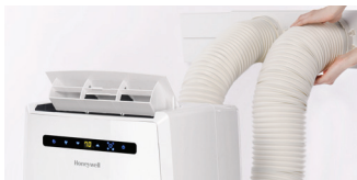
Quick and Easy Installation Dual Hose for Faster Cooling