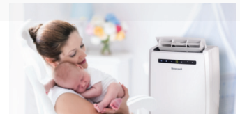
Quiet Operation - Between 51 to 53 dbA