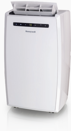
Product Dimensions (in): 18.1 (L) 15.2 (W) 29.3 (H) Net Weight: 66.4 lbs / 30.1 kg

Unlike a fixed AC, this unit requires no permanent installation and four caster wheels provide easy mobility between areas. Plus, the auto-evaporation system allows for hours of continuous operation with no water to drain or no bucket to empty. This model comes with everything needed including two flexible exhaust hoses and an easy-to-install window venting kit. The window vent can be removed when the unit is not in use.