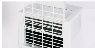
Washable Dust Filter