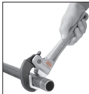
Rapid Ratchet Action