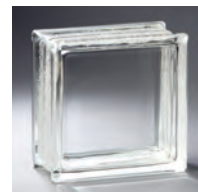
THICKSET® 90 Block, VUE® Pattern