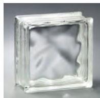
THICKSET® 90 Block, DECORA® Pattern

For more information on the Hurricane Window and other glass block products that can enhance the beauty and security of your space, visit pittsburghcorning.com .