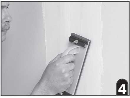
4. Sand lightly between coats. Sand final coat to a smooth finish using fine grit sandpaper.

2. Apply drywall compound in smooth light coats forcing compound through mesh into seam between drywall sheets.