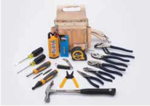
16-Piece Set 35-800