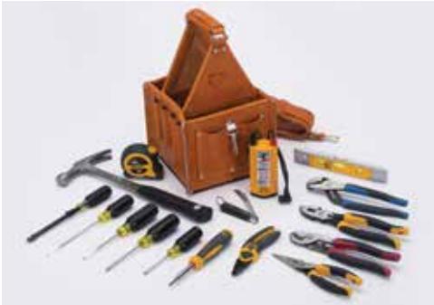
17-Piece Set 35-809