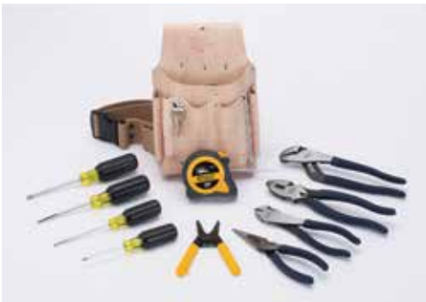
12-Piece Set 35-5805