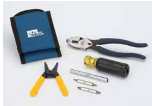
4-Piece Set 35-5799

See website or catalog for complete kit descriptions.