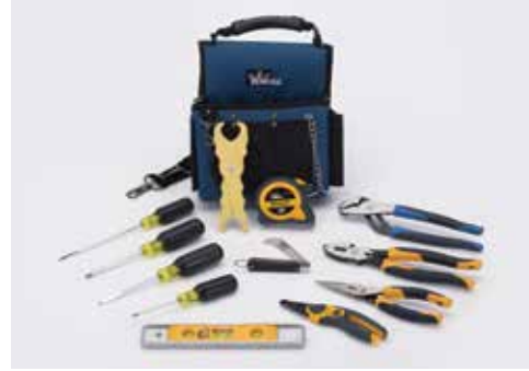
13-Piece Set 35-790