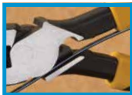
Fish tape puller