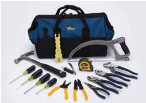
16-Piece Set 35-808