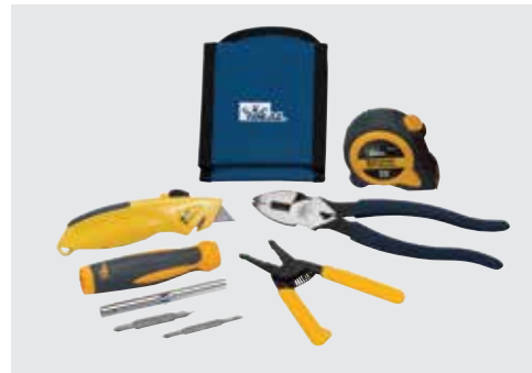
6-Piece Set 35-794