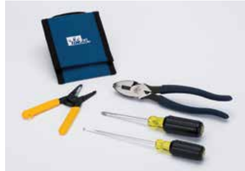
5-Piece Set 35-5792