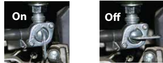
Fuel Petcock (Figure A)