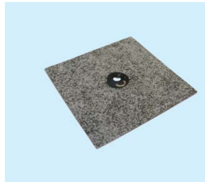
wedi Subliner Dry Flexi Collar wedi Part Number: US5000033 4 \frac{3}{4} in. x 4 \frac{3}{4} for sealing around \frac{1}{2} in. to \frac{3}{4} in. shower pipe protrusions

wedi Subliner Dry Valve Sealing Collars are applied over suitable surfaces (substrates also generally suitable for tile) using cement based tile adhesive and a \frac{3}{16} " x \frac{1}{4} " or \frac{1}{4} " x \frac{1}{4} " notched tile adhesive trowel.