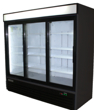
MXM3-72RSB (Black, Doors: Sliding)

Glass Door merchandisers are designed for durability and visual appeal in promoting your product. Glass door merchandisers are energy efficient and effective at keeping product at exactly the right temperature. This keeps food fresher for longer. The simple-to-use but precise digital controls allows for accuracy in temperature and flexible use of the unit.