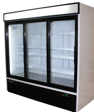
MXM3-72RS (Doors: Sliding)