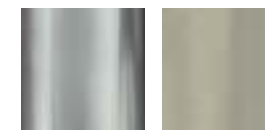
Chrome Brushed Nickel