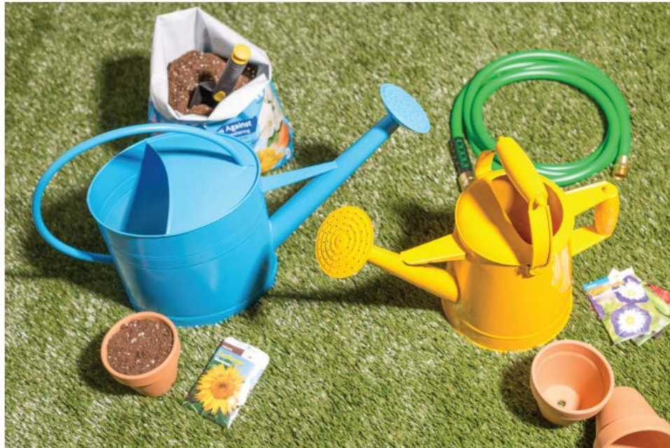
Colorful charming watering cans for your garden