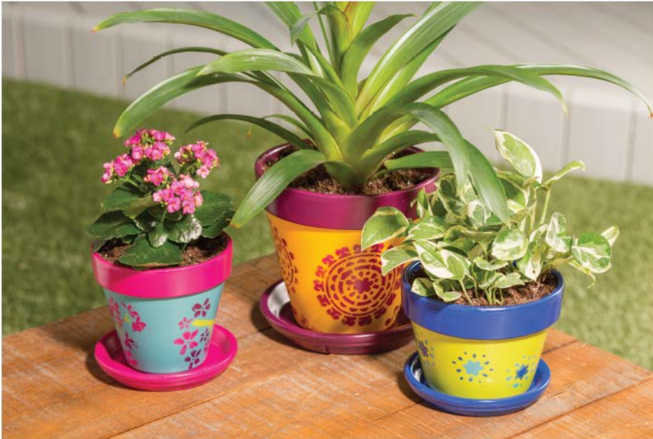
Show off your creativity with custom painted flower pots

Step 9: Allow the flower pots to dry for approximately 24 hours. Plant your flowers and enjoy your decorative stencil creations!