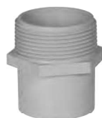
Male Threaded Adapter E920_