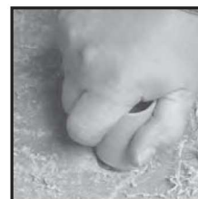
Rotate 1/4 turn.