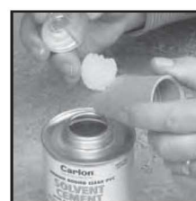
Apply a uniform coat of cement.