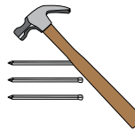
Hammer + Nails