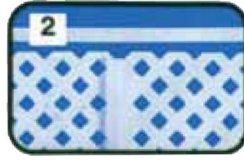
Cap & Dividers Channels