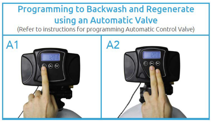
(For municipal water we recommend the system being backwashed every 5 days at 2am, or whenever your family is most likely to be asleep.)