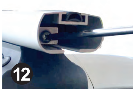
12 Use phillips screwdriver and tighten screw on both sides