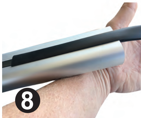
8 Slide Channel Strip Insert into the bottom of rack

READ AND UNDERSTAND ALL WARNINGS BEFORE ASSEMBLY