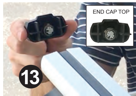
13 Insert key, unlock end cap, then insert. Once in place, lock end cap. Repeat on opposite side