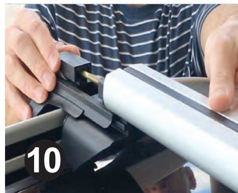
10 Slide rack into the support brace on the opposite side. (Trim Channel Strip again if rack doesn't fit completely )