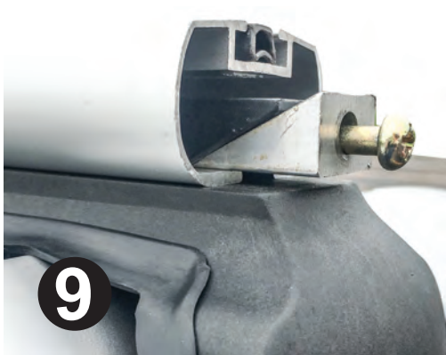
9 Loosen screw and slide rack, short Channel Strip Insert at bottom, into support brace