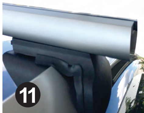
11 Center the rack, so it is evenly spaced between the two support braces