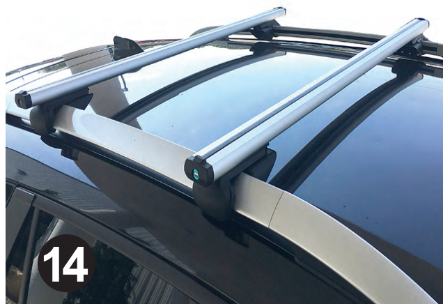
14 Repeat the process on back of vehicle

DO NOT EXCEED 165 LB MAX LOAD (INCLUDES ALL ACCESSORIES)