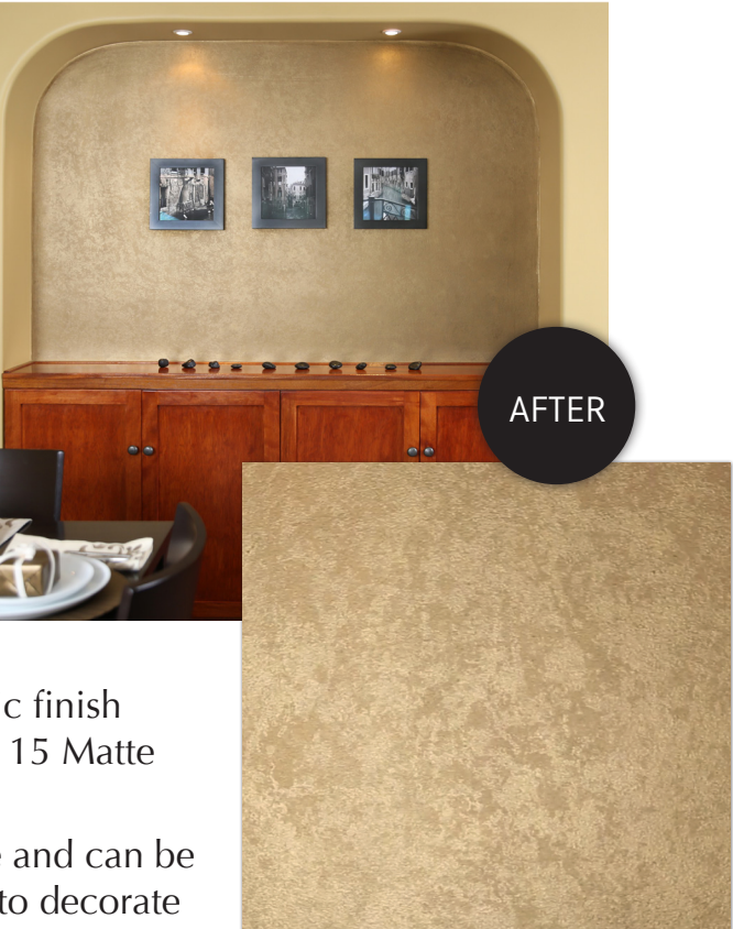
It's easy to create a shimmering tone-on-tone metallic finish using the same color in 2 different sheens. There are 15 Matte Metallic Paint Colors to choose from.

Modern Masters Metallic paint is extremely versatile and can be applied using several different tools and techniques to decorate almost anything. You are only limited by your imagination!